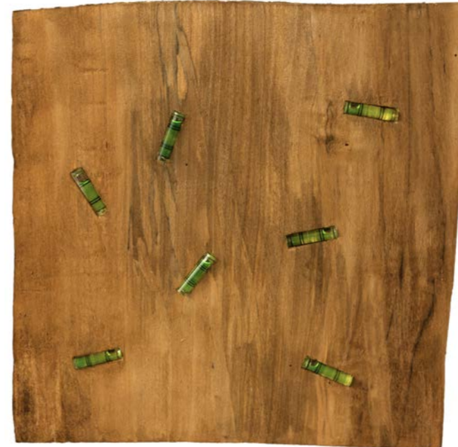
PAUL HIRSCH »same same, but different«

My installation in Tirana consists of artificial skin, wax and silicone tubes, some of which are filled with colored water. Between the artificial skin and the silicone tubes are superimposed photographic films shrink-wrapped in crystal-clear foil. The photographs are about water, ice, sand, aerial shots and other things from nature. | ID