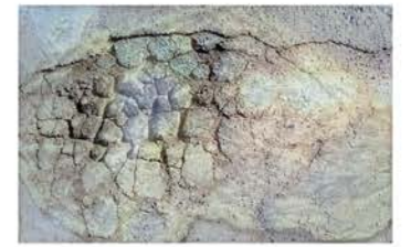
ILSE DREHER »Das Erscheinen der Wirklichkeit«

My installation in Tirana consists of artificial skin, wax and silicone tubes, some of which are filled with colored water. Between the artificial skin and the silicone tubes are superimposed photographic films shrink-wrapped in crystal-clear foil. The photographs are about water, ice, sand, aerial shots and other things from nature. | ID